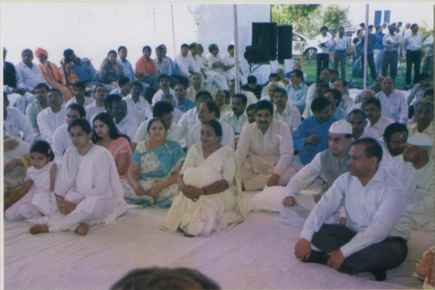
Sarva Dharma Prarthana Sabha at 6, Krishna Menon Marg, New Delhi 5 April, 2009