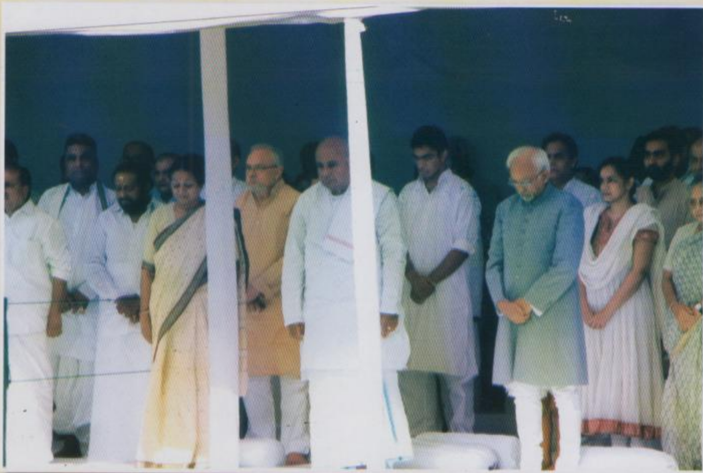
His Excellency Vice- President of India Shri Mohd. Hamid Ansari, Hon'ble Speaker, Lok Sabha Smt. Meira Kumar, Hon'ble Defence Minister Shri A.K. Antony, Ex. Prime Minister of India Shri H.D. Deve Gowda, Chief Minister of Delhi Smt. Sheila Dixit paying tributes to Babuji at Samta Sthal, Rajghat, New Delhi - 6 July, 2009

of Opposition, Lok Sabha, Shri L.K. Advani, Hon'ble Minister for SJ&E Shri Mukul Wasnik, Minister of State SJ&E Shri D Napoleon, Chief Minister of Delhi Smt. Shiela Dikshit and many other prominent dignitaries paid floral tributes to Babuji at his Samadhi. Besides them a large number of social activists and followers of Babuji paid floral tributes to him.