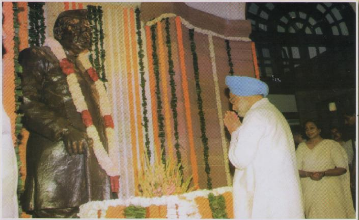
Hon'ble Prime Minister Dr Manmohan Singh paying homage to Babuji in Parliament House, New Delhi 5 April, 2009.