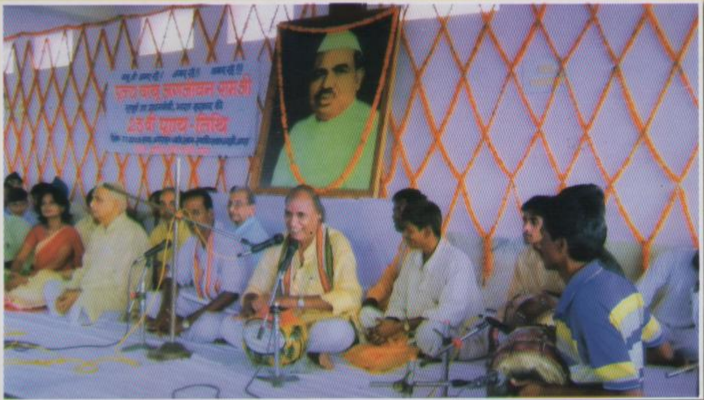
Sarva Dharma Prarthana Sabha at Chandwa, Ara – 7 July, 2009