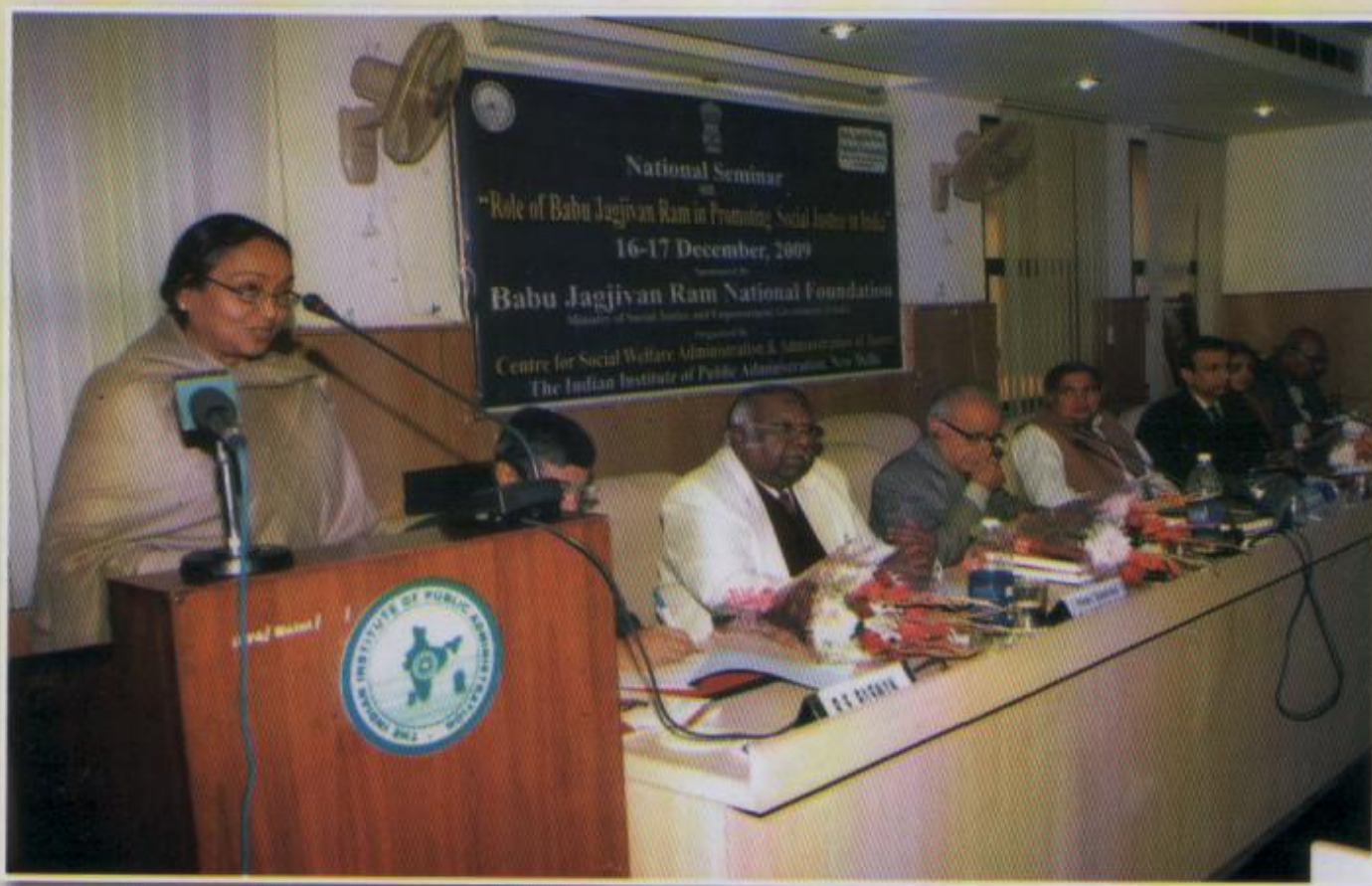
Smt. Meira Kumar, Hon'ble Speaker Lok Sabha inaugurating two-day National Seminar on Role of Babu Jagjivan Ram in Promoting Social Justice in India at Indian Institute of Public Administration- 16 December, 2009