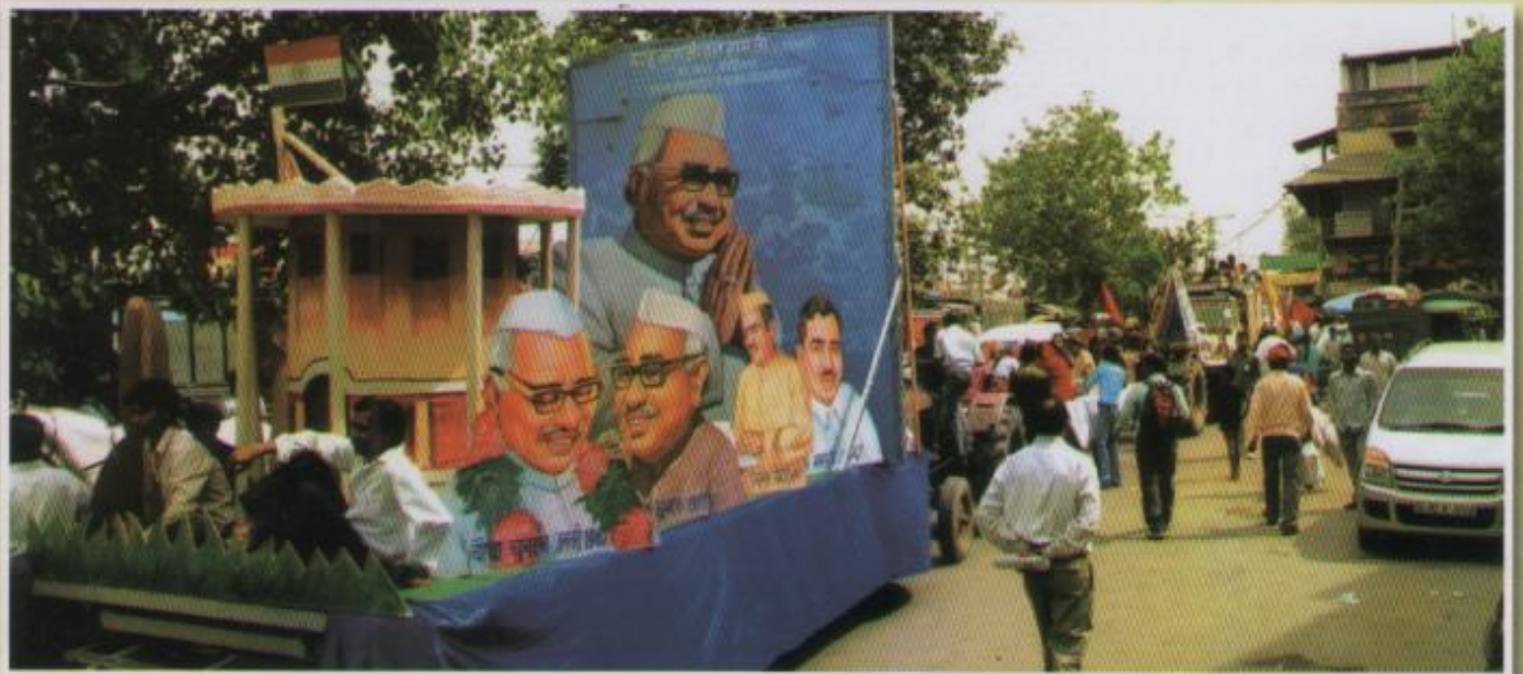
Shobha Yatra Procession in New Delhi 5 April, 2009