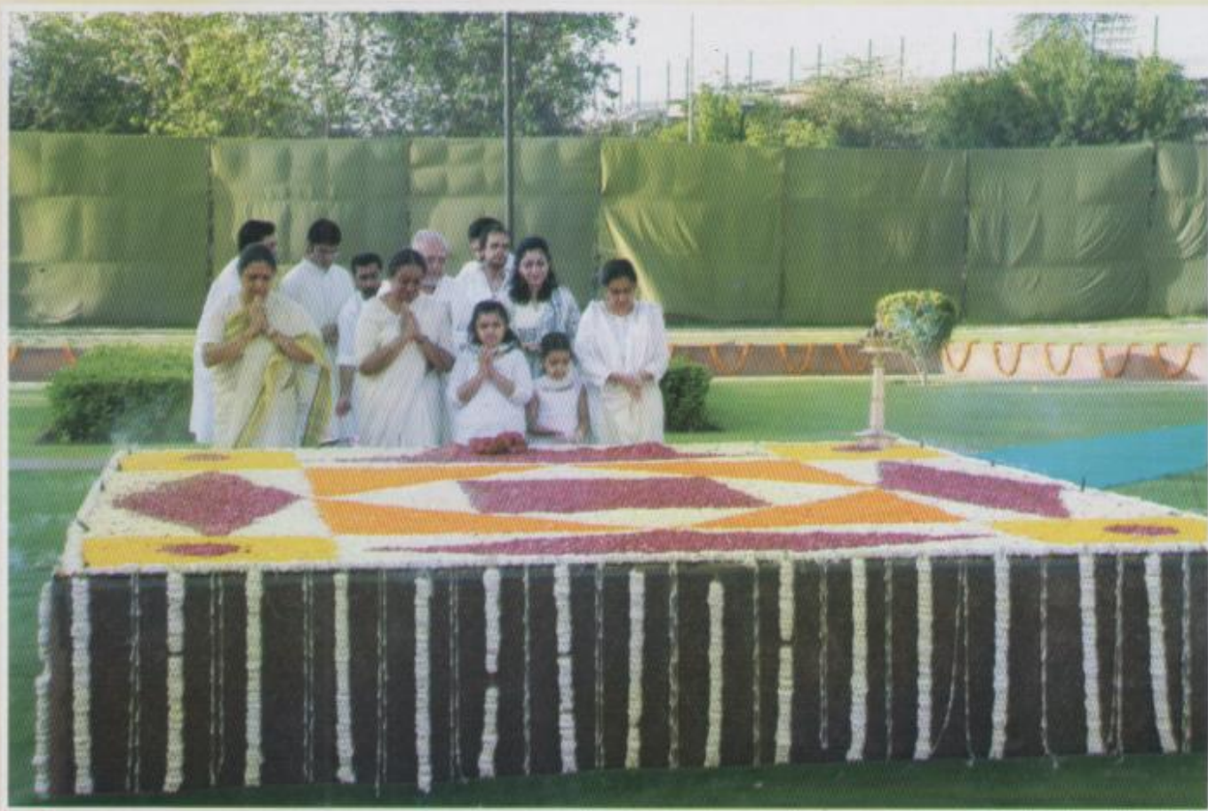
Hon'ble Minister Social Justice & Empowerment/ President (BJRNF) alongwith family members of Babu Jagjivan Ramji paying homage to Babuji at Samta Sthal, Rajghat, New Delhi- 5 April, 2009